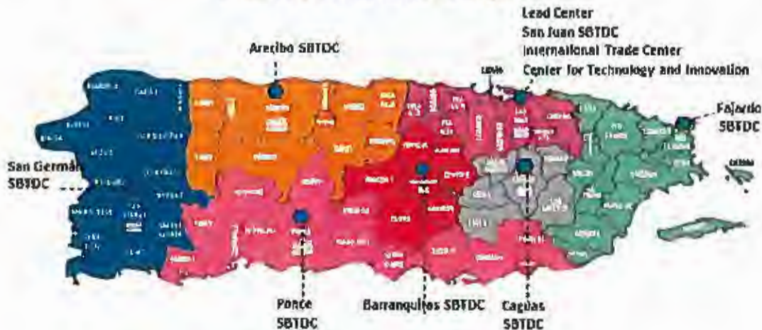
Puerto Rico SBTDC Service Regions

The Puerto Rico Small Business and Technology Development Centers (PR SBTDC) provides services to small businesses and entrepreneurs, through a cooperative agreement between the U.S. Small Business Administration (SBA) and the Inter American University of Puerto Rico (IAUPR), as host institution for the SBDC Program. The ten (10) Centers that constitute the network are strategically distributed amongst the seven (7) main regions of Puerto Rico, which ensure island-wide coverage.